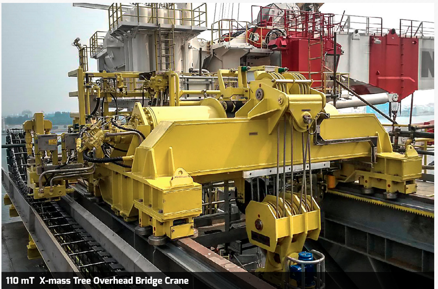
110 mT X-mass Tree Overhead Bridge Crane