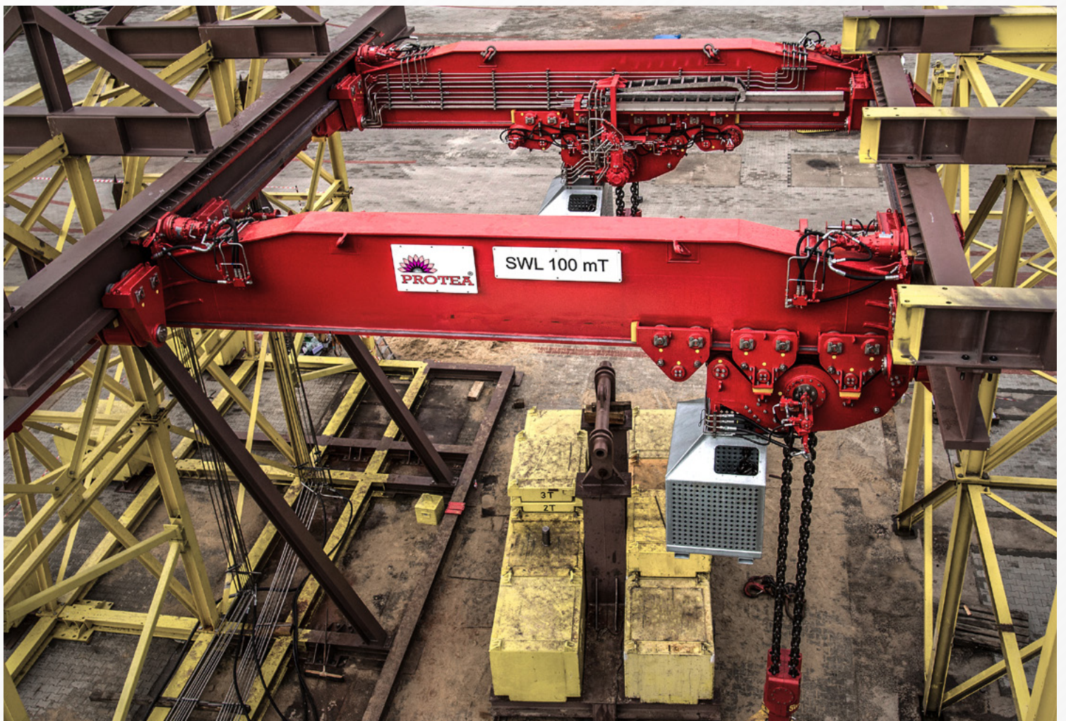
2 x 100 mT BOP Overhead Underslung Dual Separate Girder