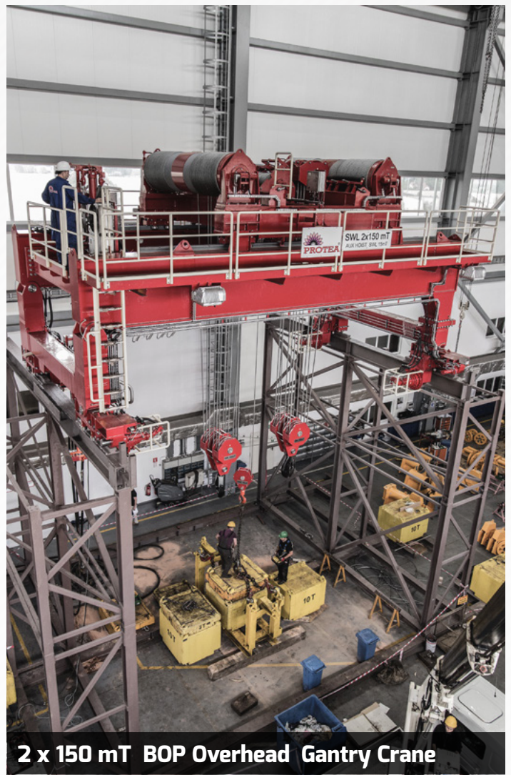
2 x 150 mT BOP Overhead Gantry Crane