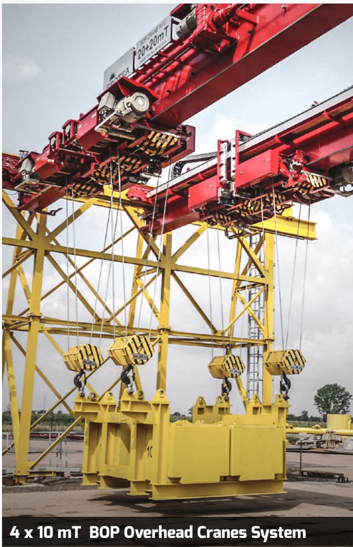
4 x 10 mT BOP Overhead Cranes System